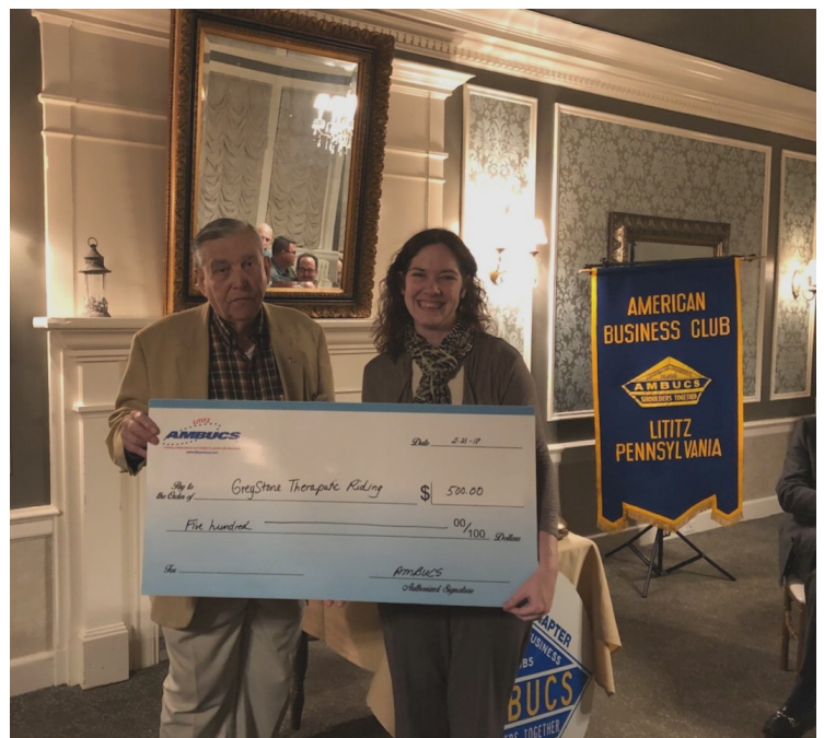
Receiving Lititz AMBUCS February 2018 donation to Greystone Manor Therapeutic Riding Center