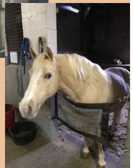
(right) Lil Lacey keeping an eye on things.