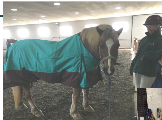
(top) Bailey was happy to shed his turnout blanket this April!

PATH International defines "therapeutic riding" as an equine-assisted activity for the purpose of contributing positively to the cognitive, physical, emotional and social well-being of individuals with special needs. Therapeutic riding provides benefits in the areas of health, education, sport, recreation and leisure. A diagnosis or disability does not have to prevent a person from riding horses! Horseback riding rhythmically moves the rider's body in a manner similar to the human gait, enabling development in balance, stability, flexibility and muscle strength.