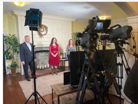
Thank you to Comfort Suites in Manheim for the donation of their Chestnut Hill Farmhouse for our live broadcast!

We hope you will join us for our 11 th annual "Mane" Event Gala to be held in-person at Bent Creek Country Club on Saturday, October 23 rd . Sponsorship opportunities are available.