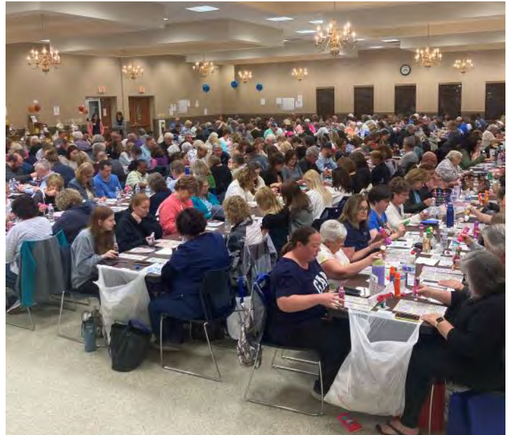
THIS is what 306 dabbers looked like on May 9th at our 1st Annual Heart of Greystone Bingo at the Farm and Home Center!

Get your dabbers ready and join us Thursday, March 13, 2025 for another fabulous FUNdraiser! More information to come soon!