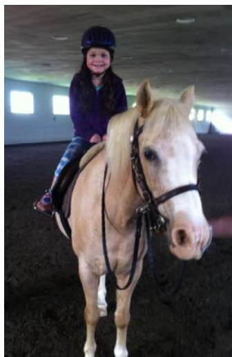
A special bond develops between our horses, volunteers, and students.

With volunteer help, individuals with special needs can become increasingly mobile, learn a degree of control over a responsive animal, and grow in self-esteem.