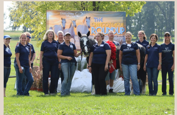
The GMTRC team poses with retired pony Wiz at GMTRC's Horse Show in September 2021.