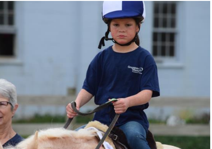
Please check our Facebook page for more photos!