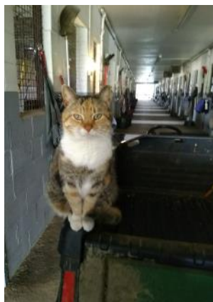
Above: Tito greets barn duty volunteers.