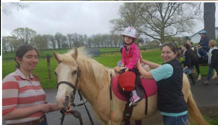
Photo top right: Volunteer schooling riders practice a group trail ride with our horses.

All extra photos: Trail ride scavenger hunts made learning walk-whoa transitions fun!