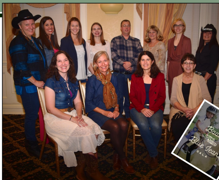
Photo op with staff, instructors and lead volunteers at the 2018 Boots and Blue Jeans Gala.